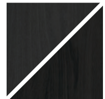
ASH C44 / OAK C44 Black matt lacquered

We treated this wood with our 'Grey brown oil'.