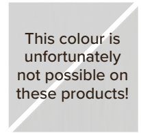
ASH C14 / OAK C14 Black stained & oiled

We treated this wood with our 'Light grey oil'.