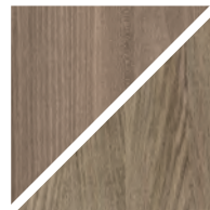
ASH C20 / OAK C20 Grey brown oiled

We treated this wood with our 'Grey brown oil'.