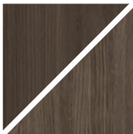
ASH C15 / OAK C15 Mocca brown oiled

C14 is for legs and storage furniture only!