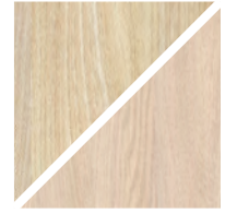
ASH C8 / OAK C8 Soaped

We treated this wood with our 'White oil'.