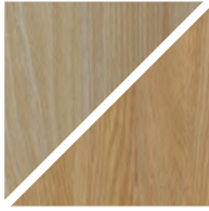
ASH C3 / OAK C3 Lacquered