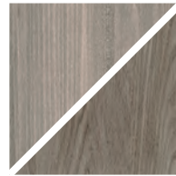
ASH C13 / OAK C13 Light grey oiled

We treated this wood with our 'Antique brown oil'.