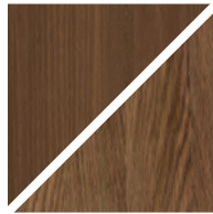
ASH C12 / OAK C12 Antique brown oiled

We treated this wood with our 'Black oil'.