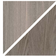
ASH C13 / OAK C13 Light grey oiled

We treated this wood with our 'Antique brown oil'.