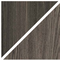
ASH C11 / OAK C11 Dark grey oiled

We treated this wood with our 'Black oil'.