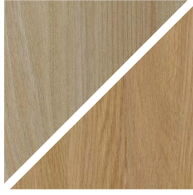
ASH C3 / OAK C3 Lacquered

We therefore recommend using the wood samples/exhibition furniture to get a more accurate impression.