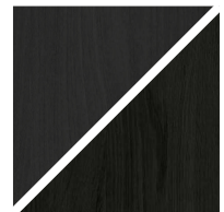
ASH C44 / OAK C44 Black matt lacquered

We treated this wood with our 'Grey brown oil'.