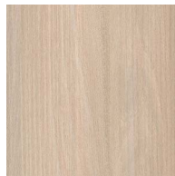
ASH C16 Warm white oiled

We treated this wood with our 'Mocca brown oil'.