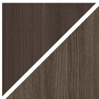
ASH C15 / OAK C15 Mocca brown oiled

C14 is for legs and storage furniture only!