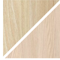
ASH C6 / OAK C6 White oiled

We treated this wood with our 'Natural oil'.