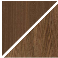
ASH C12 / OAK C12 Antique brown oiled

We treated this wood with our 'Black oil'.