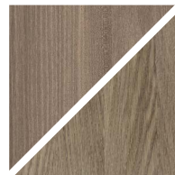
ASH C20 / OAK C20 Grey brown oiled

We treated this wood with our 'Grey brown oil'.