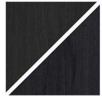
ASH C14 / OAK C14 Black stained & oiled

We treated this wood with our 'Light grey oil'.